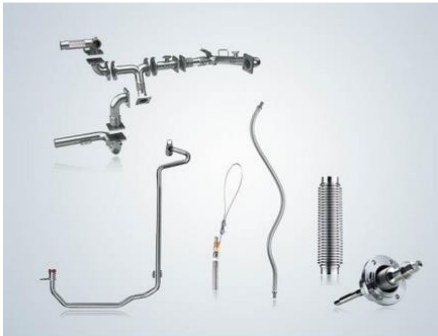
Photo 2: Components for fuel cell, H 2 , CO 2 , cooling and other media